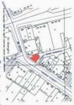
Site Location Plan Site Marked in Red